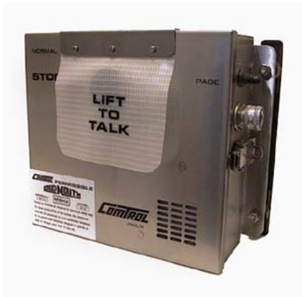
LM-1576 Face Phone