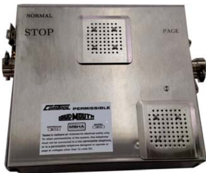
LM-26XX Face Phone